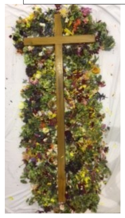
St Mary's, Hawera Good Friday Easter Day