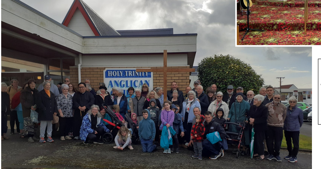
Good Friday Walk of Witness Stratford